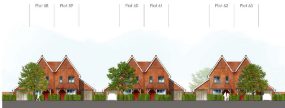
Boulevard - Primary route